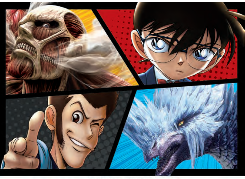
世界が羨む、日本を楽しめ! UNIVERSAL COOL YADAN 2020

Universal Cool Japan is a festival of thrills that brings iconic Japanese entertainment to life in Spring and Summer. Only at Universal Studios Japan.