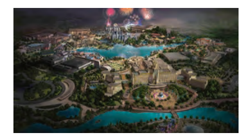
Universal Beijing Resort gets ready to open in partnership with China's State Council and the Beijing Municipal Government.